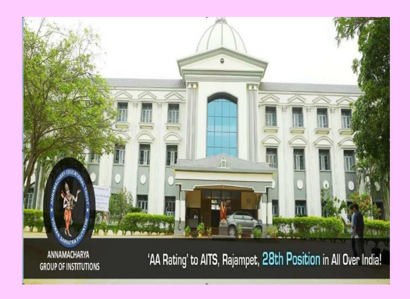
Annama charya Institute of Technology and Sciences